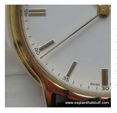
Photo: Analog and digital technology: Left: This elegant Swiss watch shows the time with hands moving round a dial. Right: Large digital clocks are quick and easy for runners to read.

Back in the late 1970s, one of the most exciting things you could own was a digital watch. Instead of trying to figure out the time from slowly rotating hands, as you had to do with an oldstyle analog watch, you simply read the numbers off a digital display. Since then, we've got more used to the idea of digital technology. Now pretty much everything seems to be digital, from television and radio to music players, cameras, cellphones, and even books. What's the difference between analog and digital technology? Which is best? Let's take a closer look!